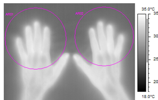
Figure 2. Example thermogram of the hands for a subject after sitting in a normothermic room for 30 minutes (i.e. at 24 °C ambient).